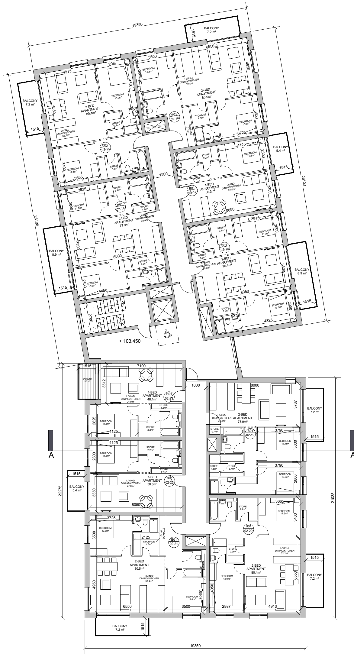
1 Block 01 - Level 02 1 : 200